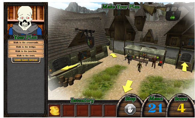
Figure 2: The interface for The Best Laid Plans . The current game mode of Make Your Plan is displayed at the top of the screen. The Dark Overlord (top left) watches telepathically and occasionally offers information and guidance. The player’s current plan is displayed under the portrait of the Dark Overlord. The player’s inventory, mana, and score are shown at the bottom of the screen. The location pictured here is the town. The characters in the scene are, from left to right, the town guard, the goblin, and the weapons merchant. The player can interact with the other characters and items with a simple point-and-click interface. Yellow arrows allow the goblin to walk to other locations, such as the tavern (west), the alley (north), the junction (south), and the potion shop (east).

A planner is an algorithm which finds a sequence of these atomic actions that achieve some goal (Russell and Norvig 2003). The planner’s goal is the opposite of the player’s goal: that the goblin not have the hair tonic or that the goblin be dead. Glaive extends classical planning by also reasoning about narrative phenomena. It uses Riedl and Young’s intentional planning framework (2010) to ensure that every