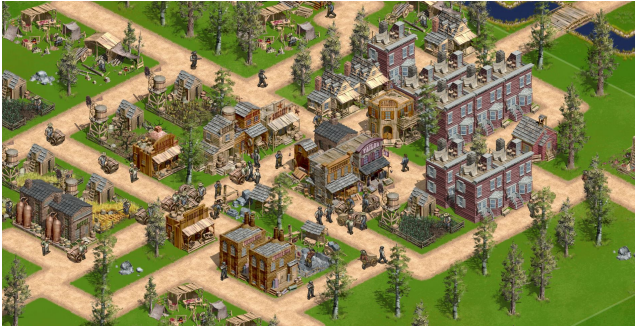
Figure 1: A screen shot of the game 1849 .

1849 is a simulation game set during the California Gold Rush, released in May 2014 for PC/Mac computers, and iOS and Android tablets.