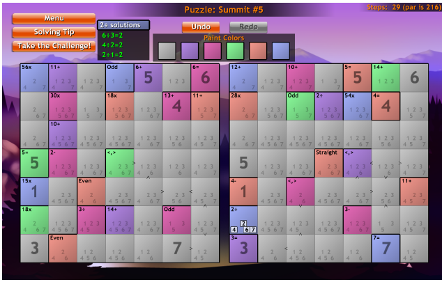
Figure 3: A 7x7 double-board, hidden-cage puzzle from Everyday Genius: SquareLogic . This puzzle is one of 200 found in the game’s 23rd location (Summit) of 42 locations included in the PC version.

est” games on Steam (where the game has currently received 92 positive and 0 negative reviews).