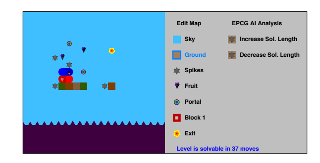
Figure 2: Anhinga gameplay and editing screens.

If a level is too difficult for a user to solve, there is a solve button which solves the level and then animates the solution. The editor currently displays the optimal solution length of a level and also offers simple editing of other gameplay elements. The capabilities of the editor are still under active development and will continue to change and be updated as we implement new capabilities.