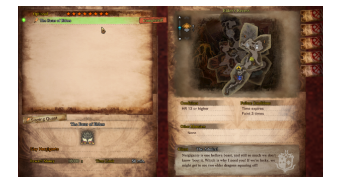
Figure 2: Screenshot of Monster Hunter World which shows the presentation of "The Eater of Elders" quest

Monster Hunter: World [4] is an action RPG where the goal is to fight fantastical monsters on a jungle island. In order to fight these monsters, players must go on quests. Players can play by themselves, or with a party of up to four people. Figure 2 shows the quest book that the player uses to select quests to fight monsters. After a player defeats a monster, there is a 30 second window in which players can complete additional actions such as picking up items in the world or carving the monster. When the timer is finished, the player returns to the village and receives rewards.