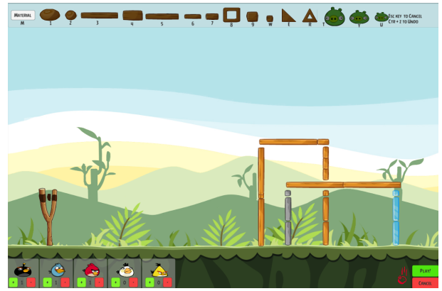
(b) Structure generated by our system from the drawing shown on the left.