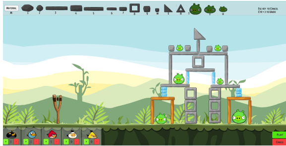
Figure 2: Example of a level being created with the manual module.