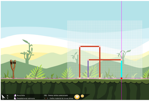
(a) Drawing tool of the mixed-initiative module.